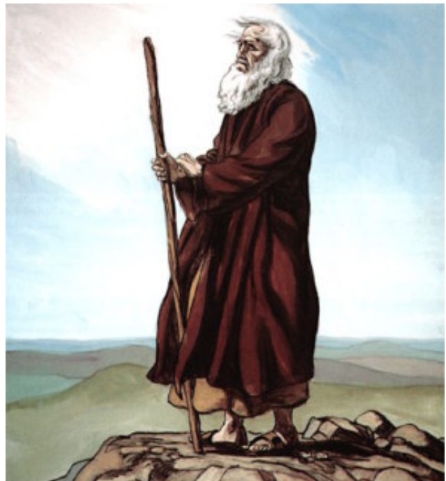
The Death of Moses