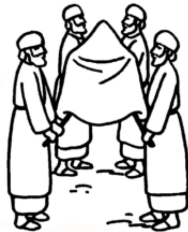
Ark of Testimony