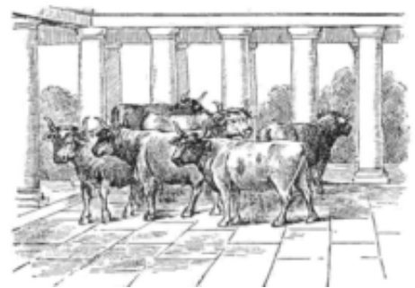
How many cattle were given?