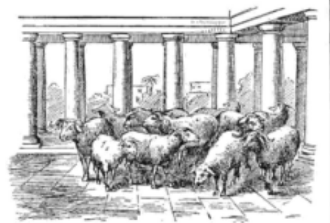
How many sheep were given?