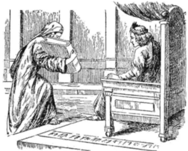
Who took the book to the king?