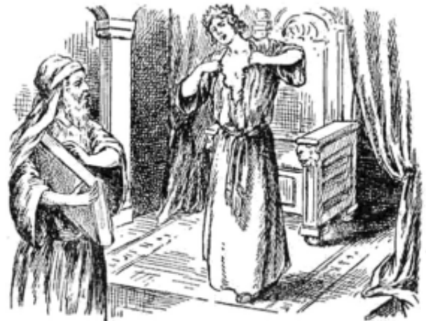
What did the king do after hearing the book read?