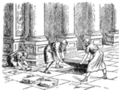
What was repaired?