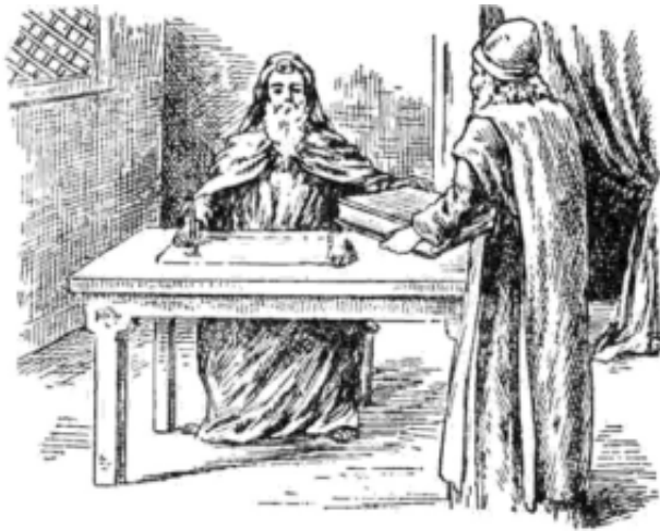
Who found the book?