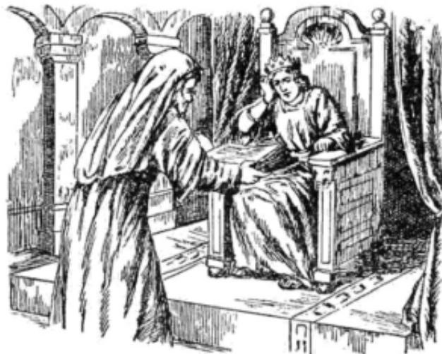
Who read the book to the king?