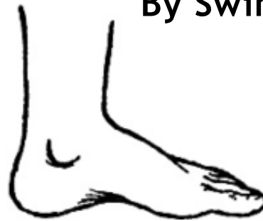
By Foot on Dry Ground