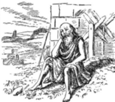
Job went and sat among the _____.