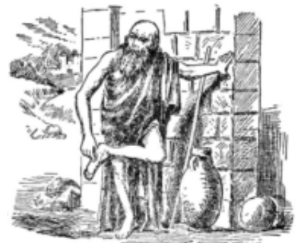
Job scraped his boils with a piece of _____.