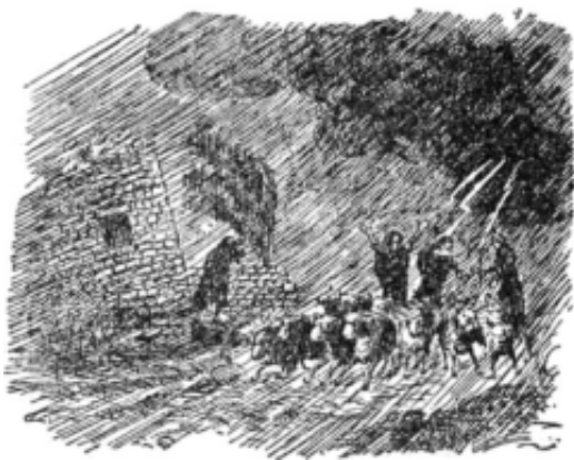
_____ from heaven killed sheep and servants.