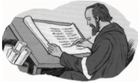
Doctors of the Law