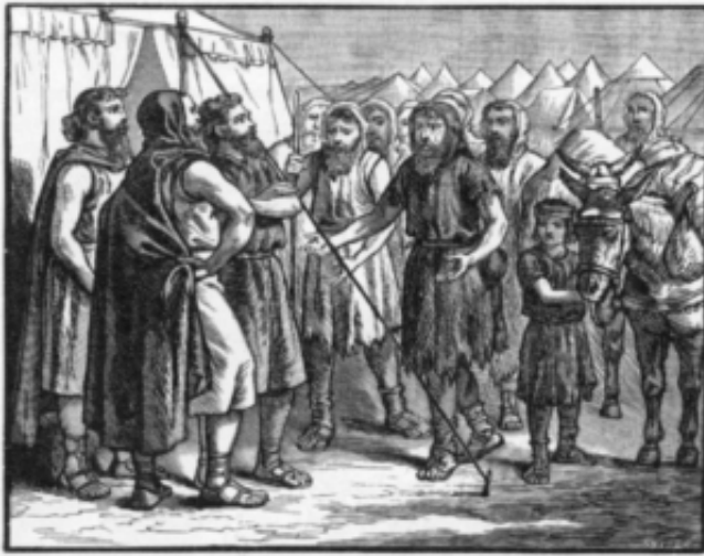
THE GIBEONITES DECEIVE THE MEN OF ISRAEL.

The Israelites had defeated the cities of Jericho and Ai ( AY-i ). They were getting ready to move on and conquer the rest of the people in the Promised Land. God commanded Joshua to destroy these idol-worshipping people so that they would not turn the people of Israel away from the worship of the one true God.