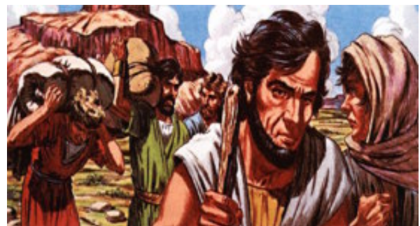
Cain Became a Fugitive

" . . . My punishment is greater than I can bear." —Genesis 4:13 ~~~~~